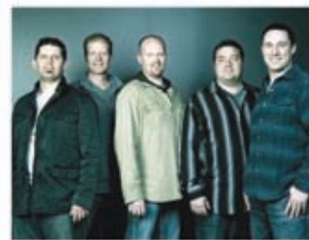
Musical Guest: This Hope

Englewood Baptist Church 1350 S. Winstead Avenue Rocky Mount, NC 27803 (252) 937-8254